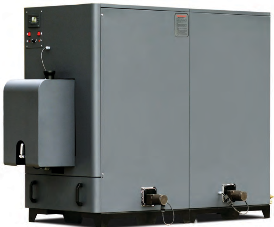
100 kw caria system